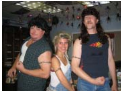
The EM lab at Georgia shows off their mullets and muscle.